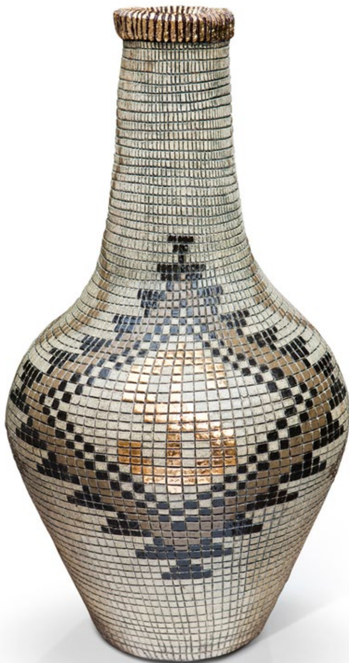
LUCINDA MUDGE Pixel Vase Collection (Gold Dollar Sign) 2017 56 cm high