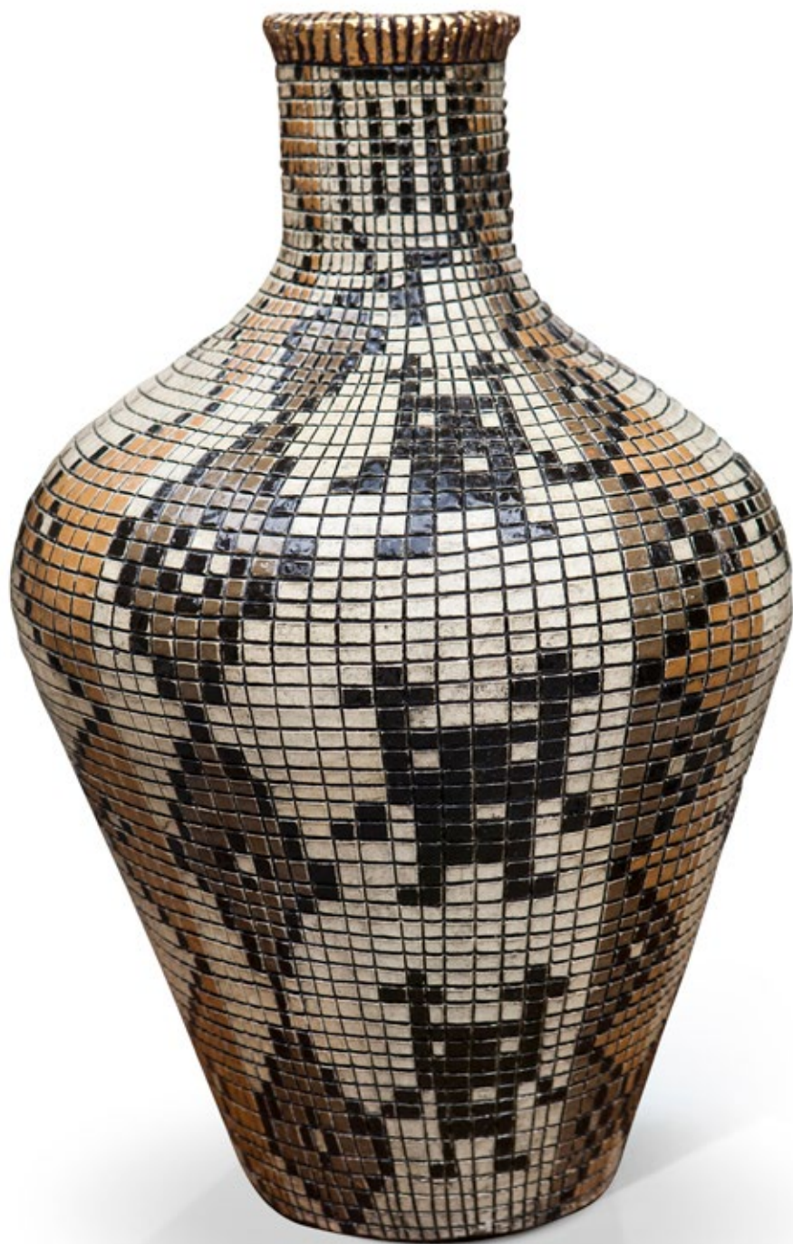
LUCINDA MUDGE Pixel Vase Collection (Hi!) 2017 48 cm high