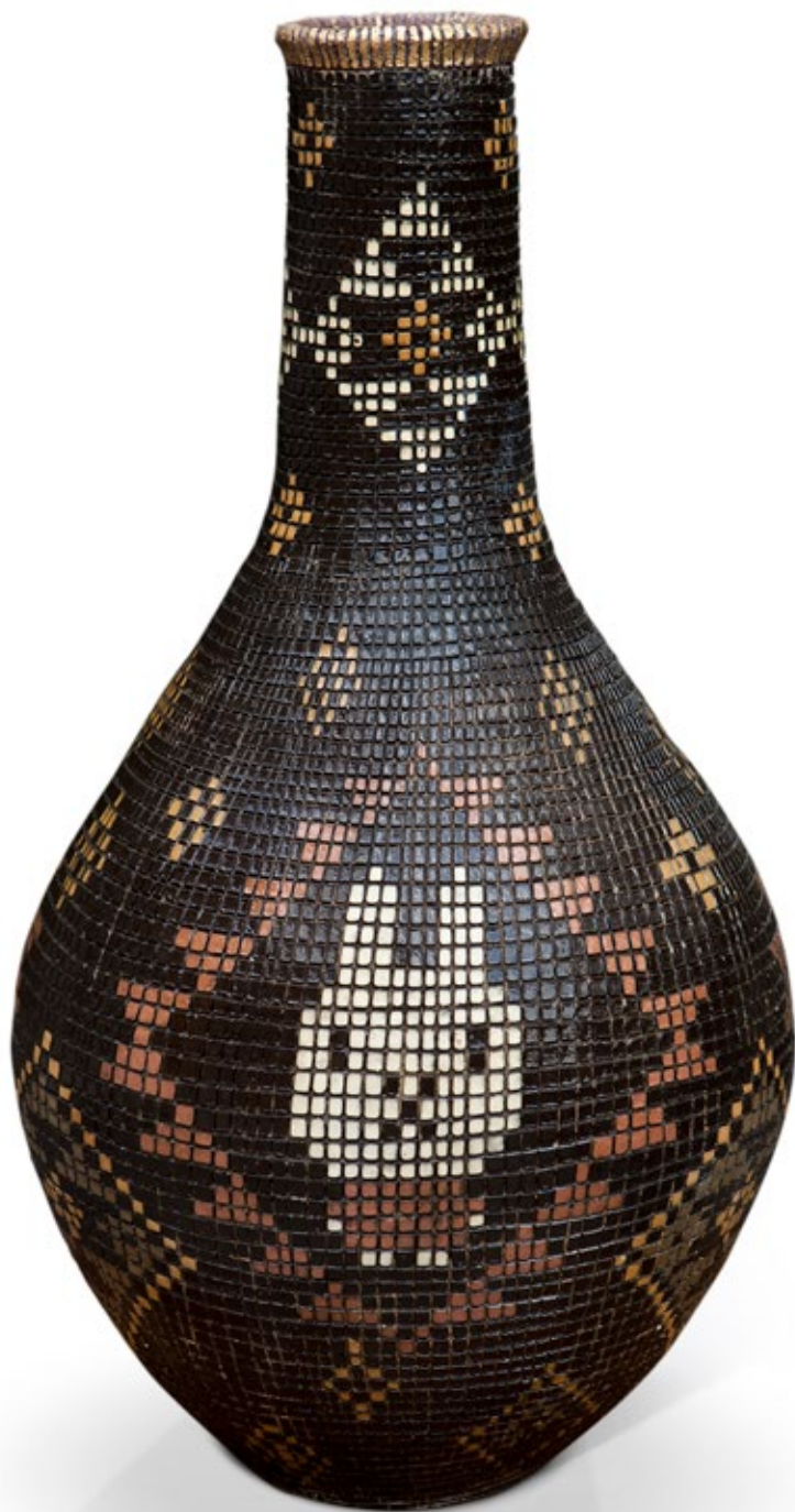
LUCINDA MUDGE Pixel Vase Collection (Miffy) 2017 68 cm high