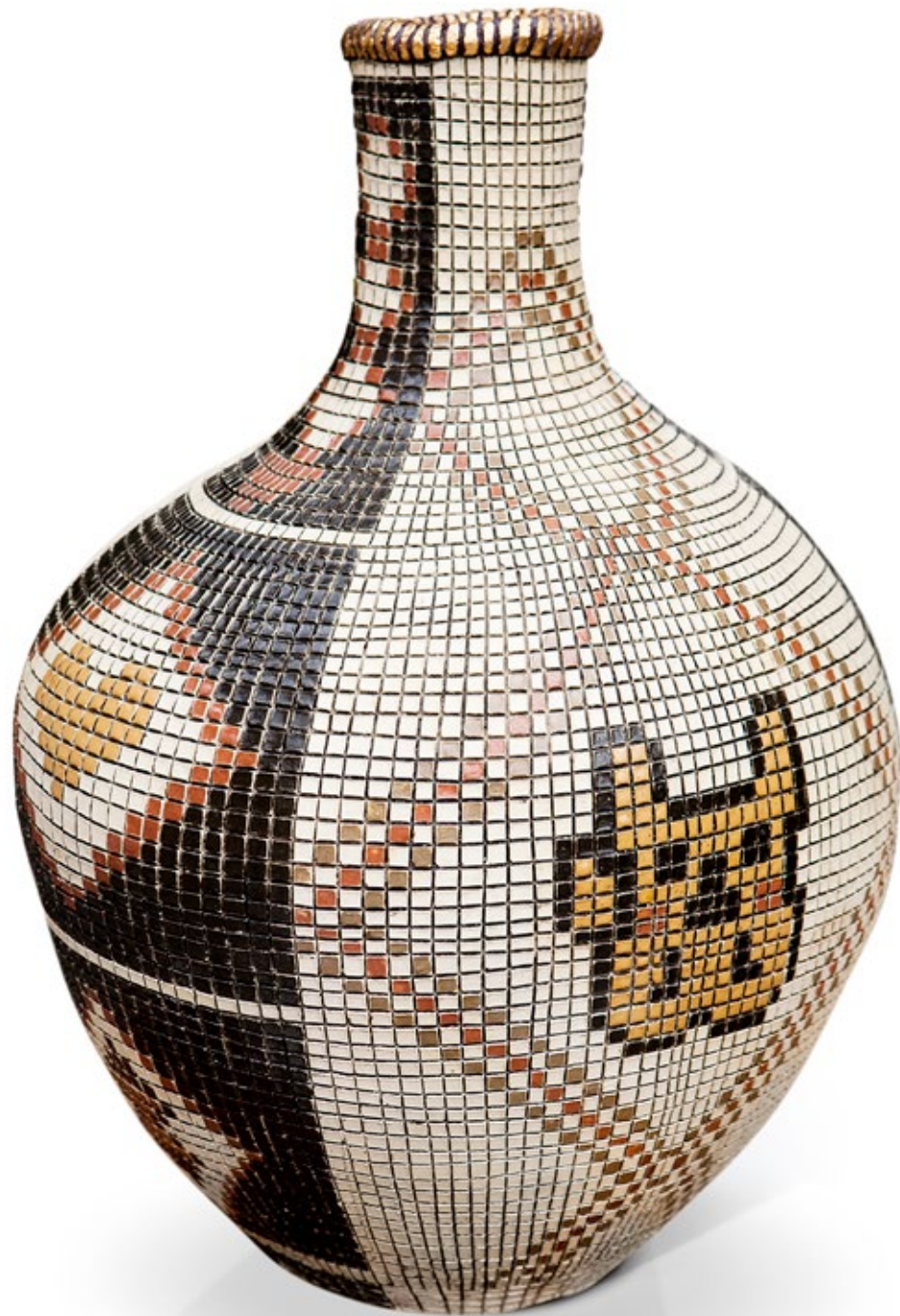
LUCINDA MUDGE Pixel Vase Collection (Pikachu) 2017 52 cm high