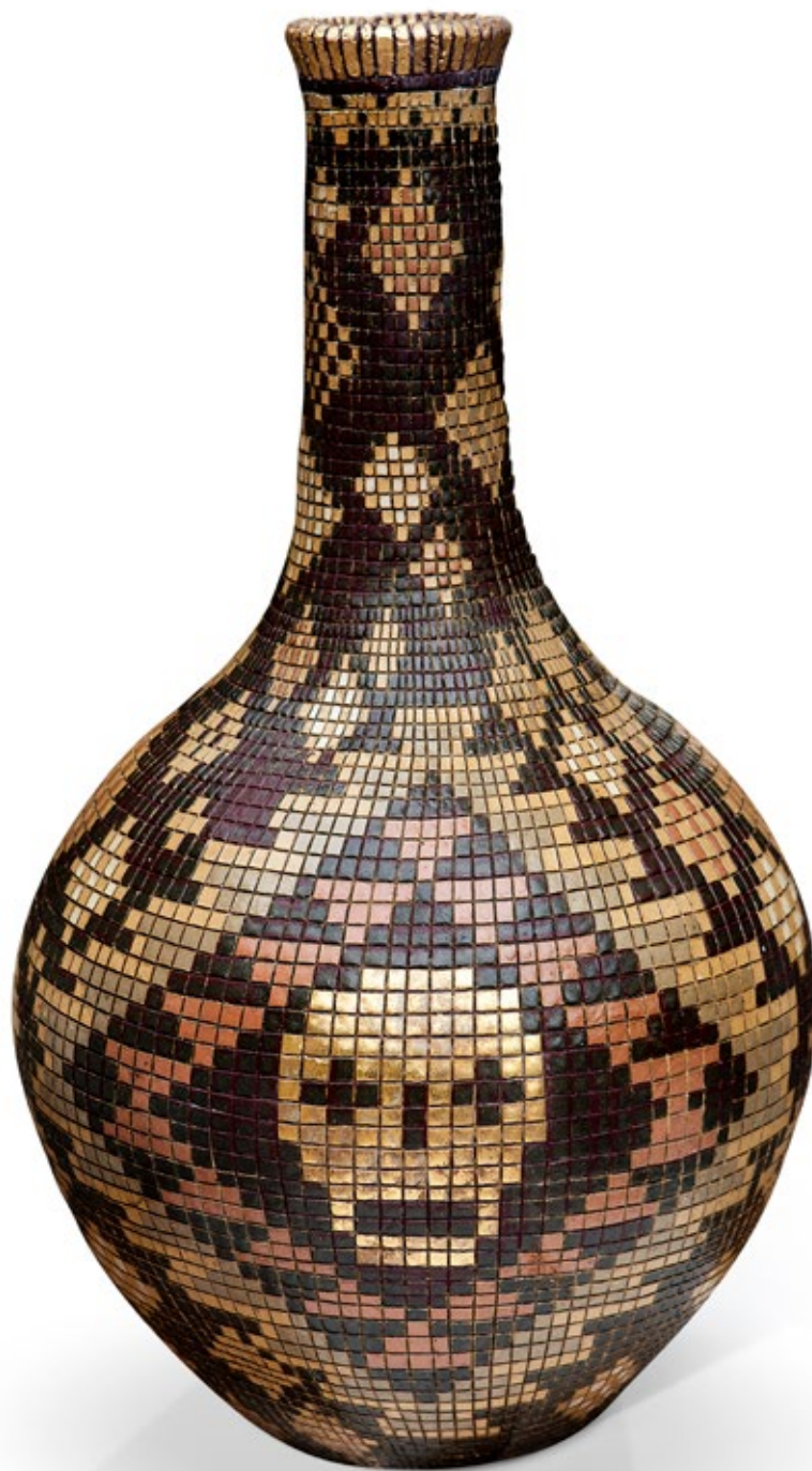
LUCINDA MUDGE Pixel Vase Collection (Sugar Skulls) 2017 62 cm high