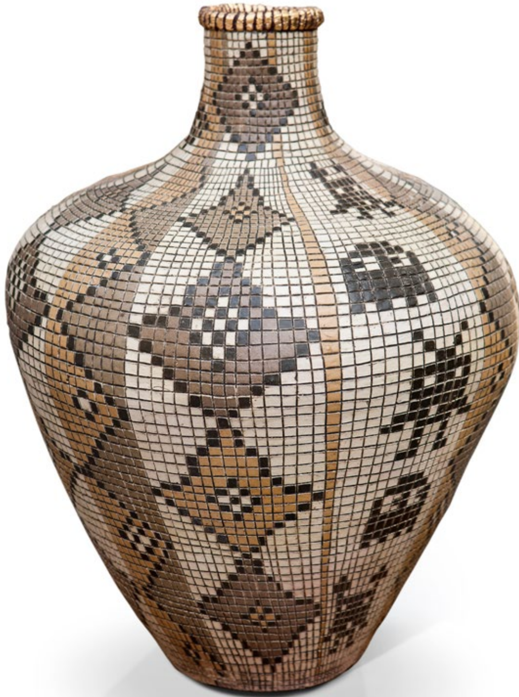
LUCINDA MUDGE Pixel Vase Collection (Pacman) 2017 58 cm high